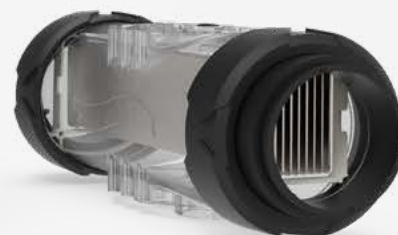
Minisalt 8 g/h and more