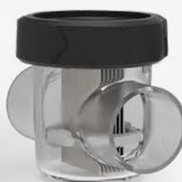
Minisalt XS 4 and 6 g/h